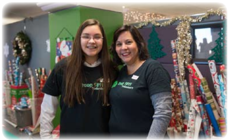
Girl Scout Troop 1611 helping with the Mission Arlington Christmas Store.