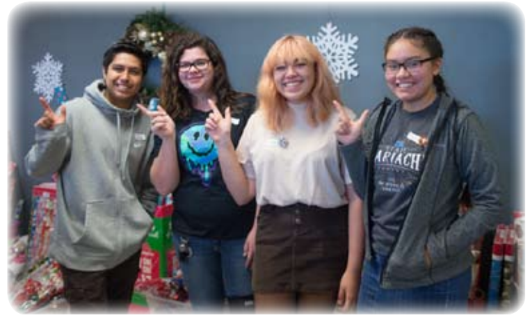
Sam Houston High School NHS volunteers.