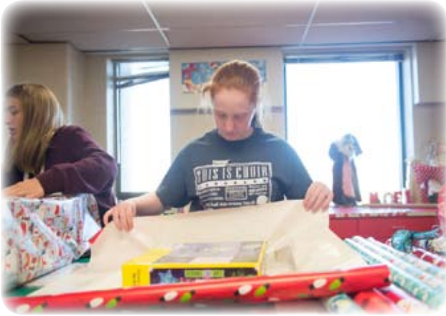
Volunteers working the gift wrap station (Photo by Jason Waite / Arlington Voice).