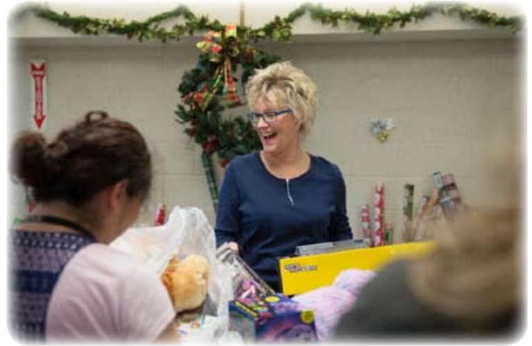
A volunteer spreads Christmas Cheer at the gift wrap station. (Photo by Jason Waite / Arlington Voice).