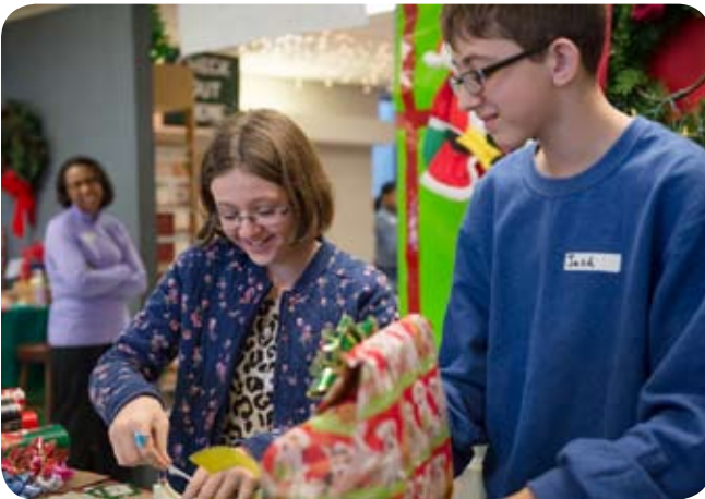
Volunteers wrap Christmas gifts for shoppers.