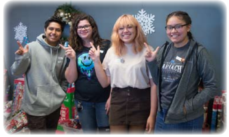
Sam Houston High School NHS volunteers.