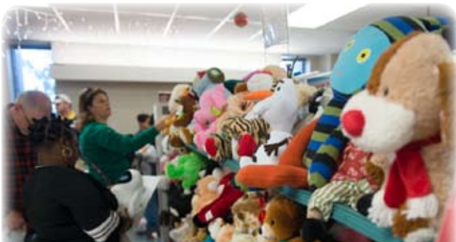
Shopping assistants help choose Christmas gifts.