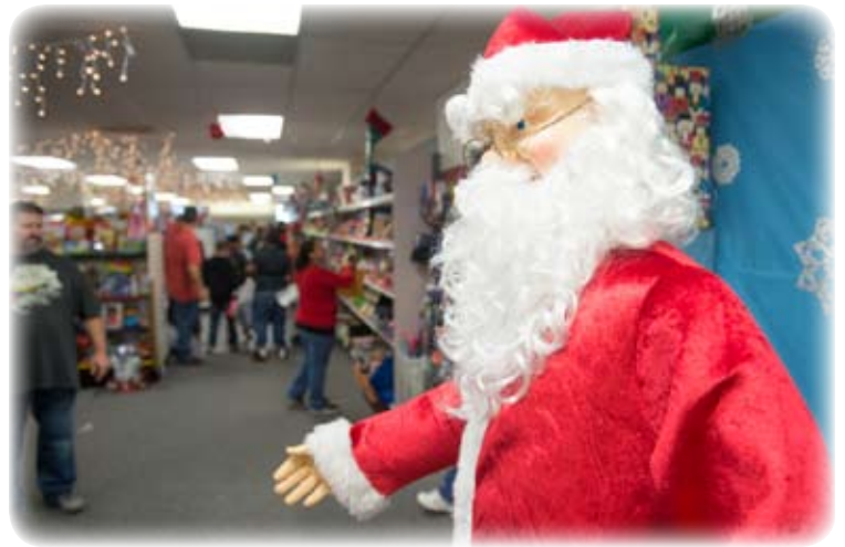
The Mission Arlington Christmas Store.