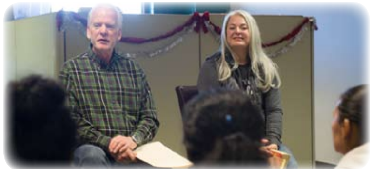
Shoppers hear the Christmas Story.