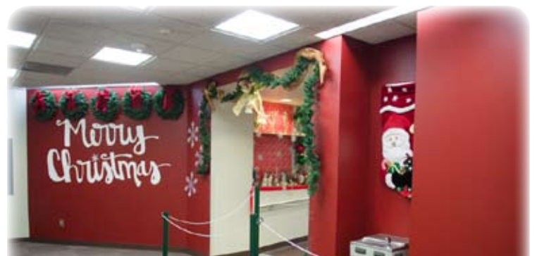
The grand entrance to the Mission Arlington Christmas Store. (Photo by Jason Waite / Arlington Voice).

Once they enter the store, they are greeted by dozens of shelves of complimentary toys, dolls,