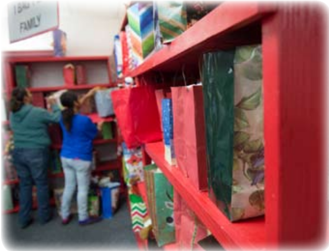
Gift bags at the Mission Arlington Christmas Store.