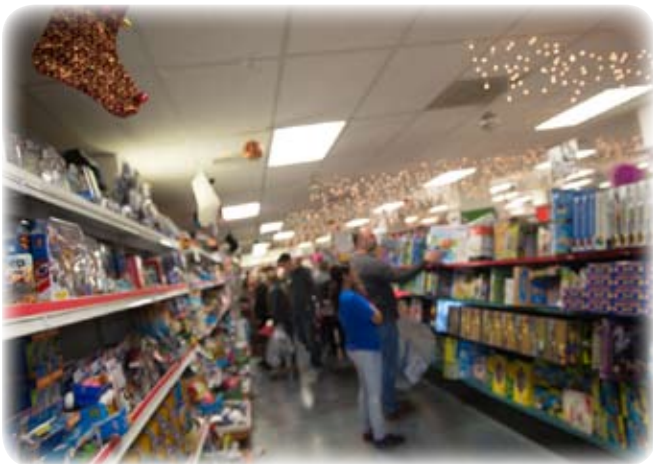
The Mission Arlington Christmas Store.