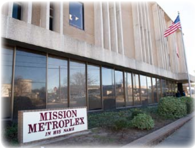
The Exterior of Mission Arlington in downtown (Photo by Jason Waite / Arlington Voice).