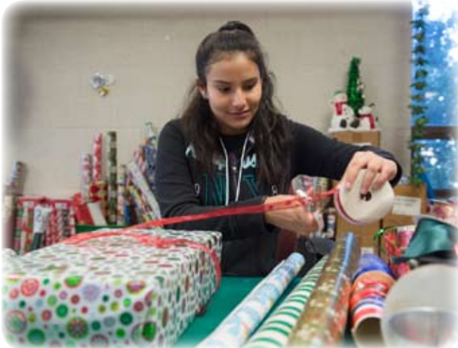
Gift Wrapping station at Mission Arlington Christmas Store

The market, in its 28th year, is run by hundreds of volunteers -- and one tireless leader