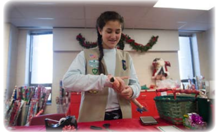
A girl scout volunteer wraps a gift at the Mission Arlington Christmas Store. (Photo by Jason Waite / Arlington Voice).