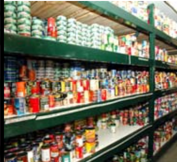
FOOD FOR FAMILIES