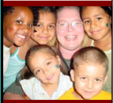
YOUNGER KID'S CAMP