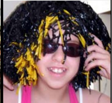
FUN AND GAMES