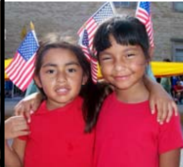
JULY 4TH PARADE