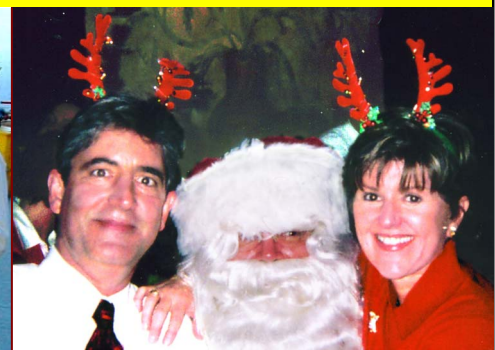
GM partners again with the Christmas Store, making a difference for children.