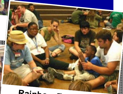
Rainbow Express at Central Revival