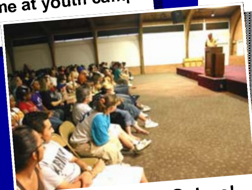
Youth Back-to-School Rally