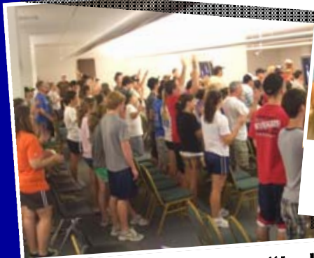
Mission groups at "In His Name" Training Center