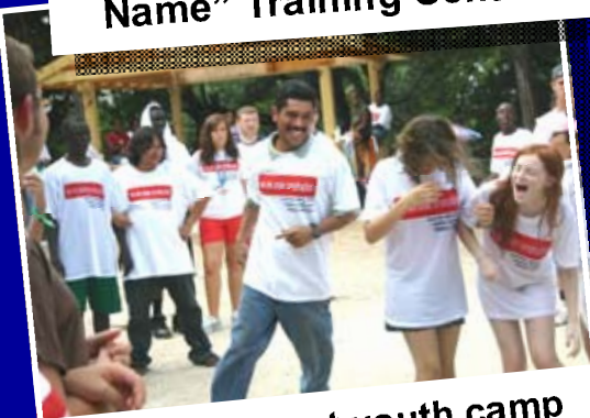
Games time at youth camp