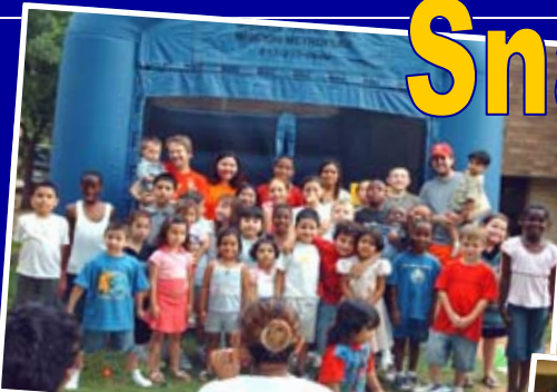
The bouncy house at a summer carnival