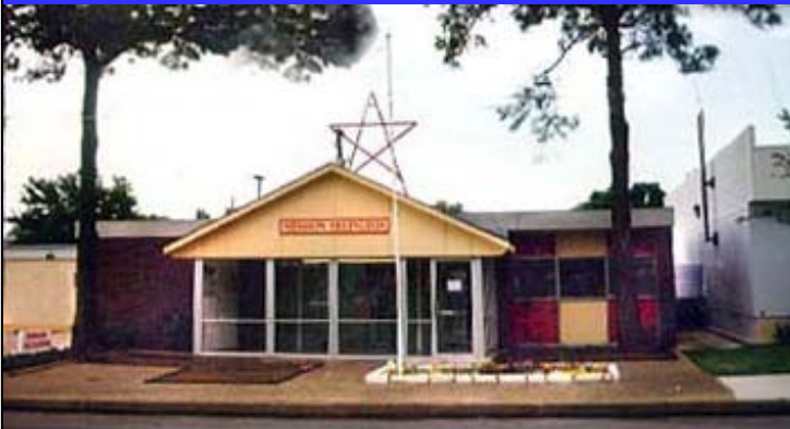
A Picture of Mission Arlington from the 1990s

Mission Arlington will turn 20 years old on August 1st. We can be who we are today, because of the constant support of this wonderful community. We simply give what you provide on a daily basis to people experiencing a time of crisis.