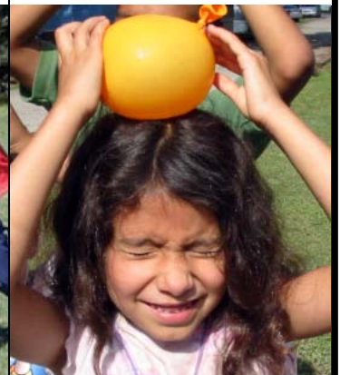
Fun with Games