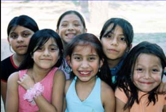
Pre-teens enjoying a Mission Arlington led Bible Study outside of their apartment.

It isn’t hard to realize that many people are disconnected from the church. Mission Arlington wants as many people to know about Jesus as possible. To make church more accessible, volunteers from Mission Arlington lead Bible studies each week where people live—in 265 different locations across our community. This happens in several different locations and in multiple languages.