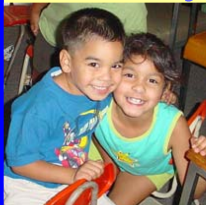
200 families each day, six days a week are coming through Mission Arlington's front door for emergency assistance.

REAL HELP FOR PEOPLE We know that many kinds of crises bring people to our front door. Mission Arlington treats each person and every family with dignity and respect. We provide real help in life's most difficult moments.