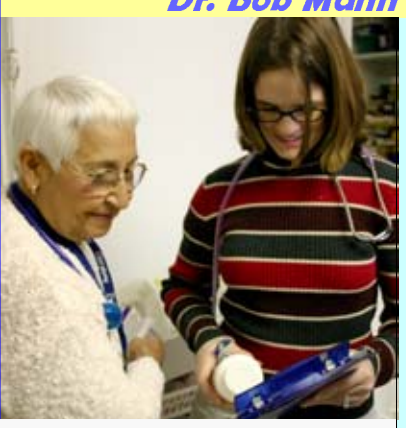
926 patients were helped in September. Patients received $97,978 worth of FREE medical care in the month of September alone.

CLINIC SERVICES EXPAND Mission Arlington's medical services include optometry, obesity intervention, and an ability to help people with ongoing medication needs.