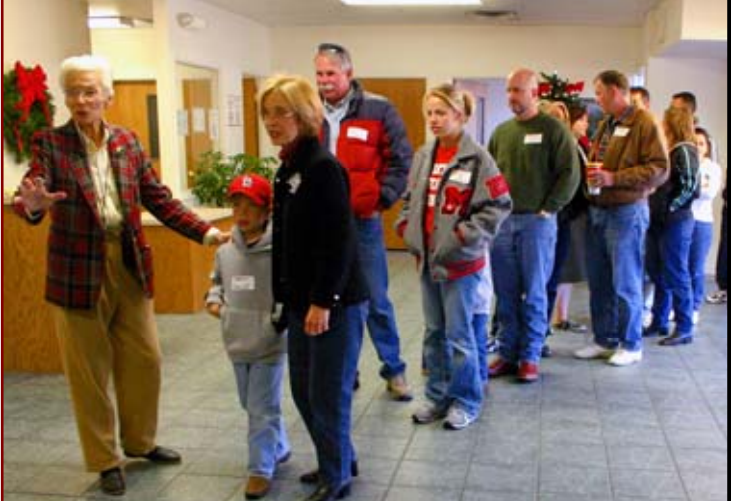
Volunteers deliver food to families Thanksgiving day 2004