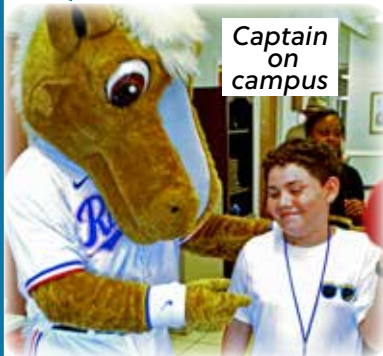
Captain on campus

20 youth treated on Teen Dental Day (Aug. 17th)