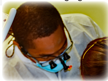
Health Clinics Stay Full