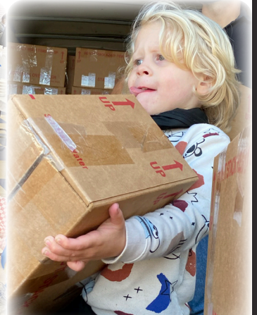
Families serve together