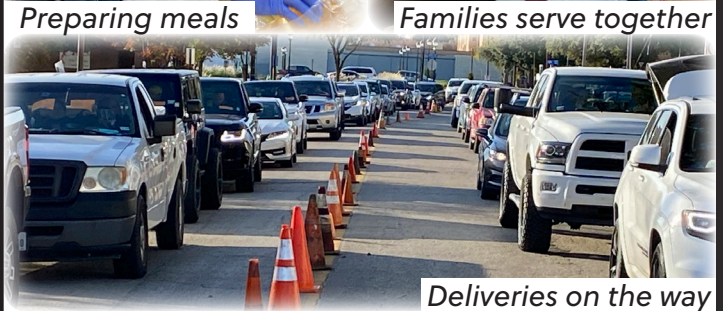
Deliveries on the way