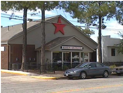
The front door of Mission Arlington's main office