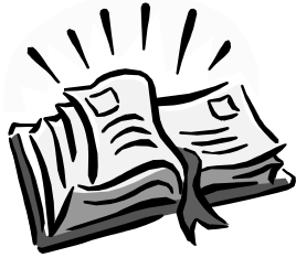
Hide God's Word in your heart! Psalm 119:11

Memory Verse Activities for Isaiah 40:31 - Play tag, like "Sharks and Minnows." but call it "Eagles and Mice."