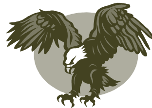
Those who wait on God...

Make eagle snacks. Stack a coconut bonbon on top of an chocolate and crème cracker. Insert a cashew for the nose and paint on eyes.