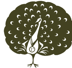
Haman was proud as a peacock. He strutted around bragging.

Make colorful peacocks. Small children can simply trace their hands while older students can cut individual pieces for the plumes. Talk about the saying “proud as a peacock.” Review the memory verse.